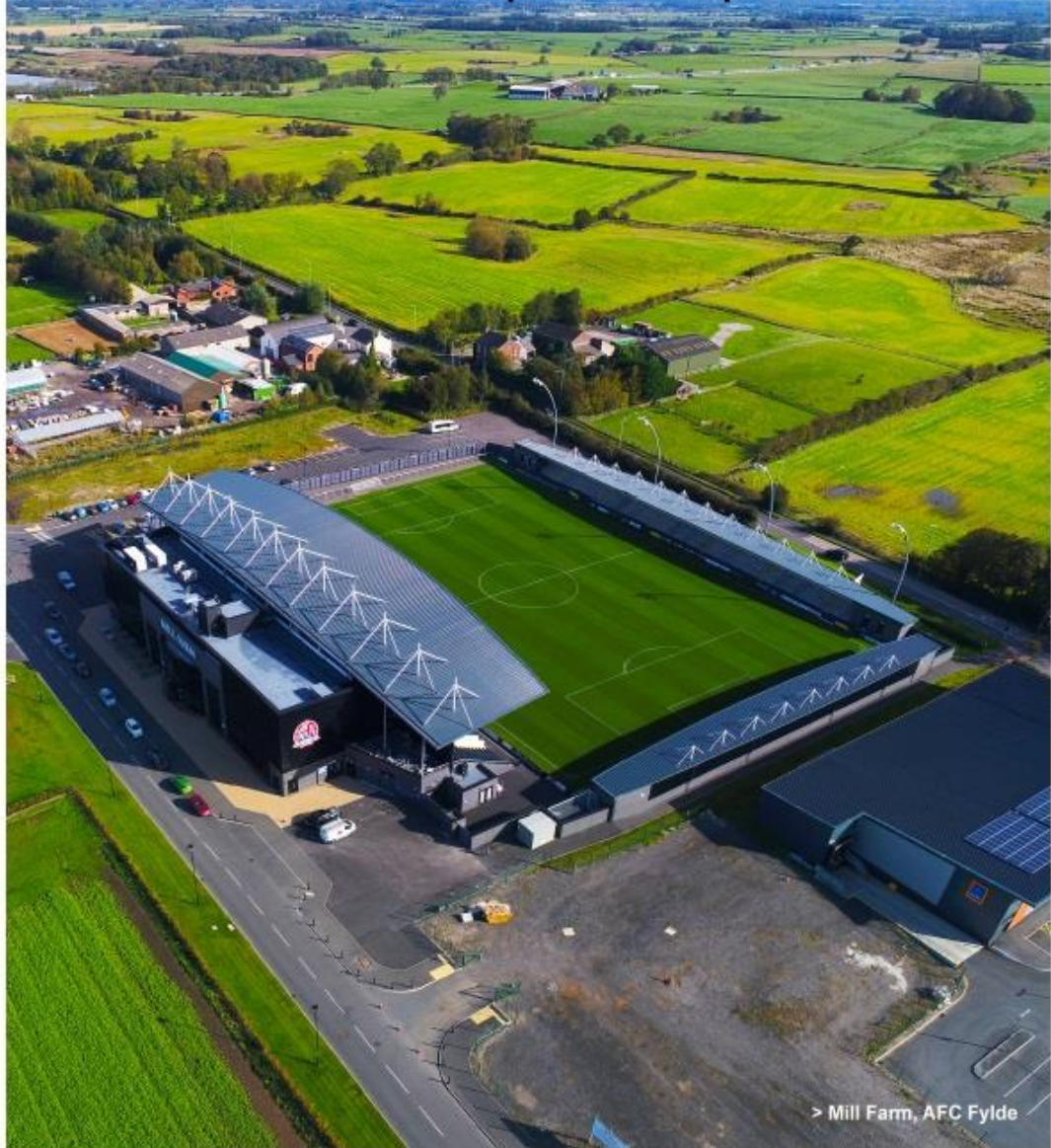
> Mill Farm, AFC Fylde

architecture • project management • structural engineering • interior design building surveying • m&e design • quantity surveying • cdm consultancy