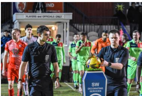
Picture - Sporting and The Lambs emerge at The Victoria Ground earlier this season