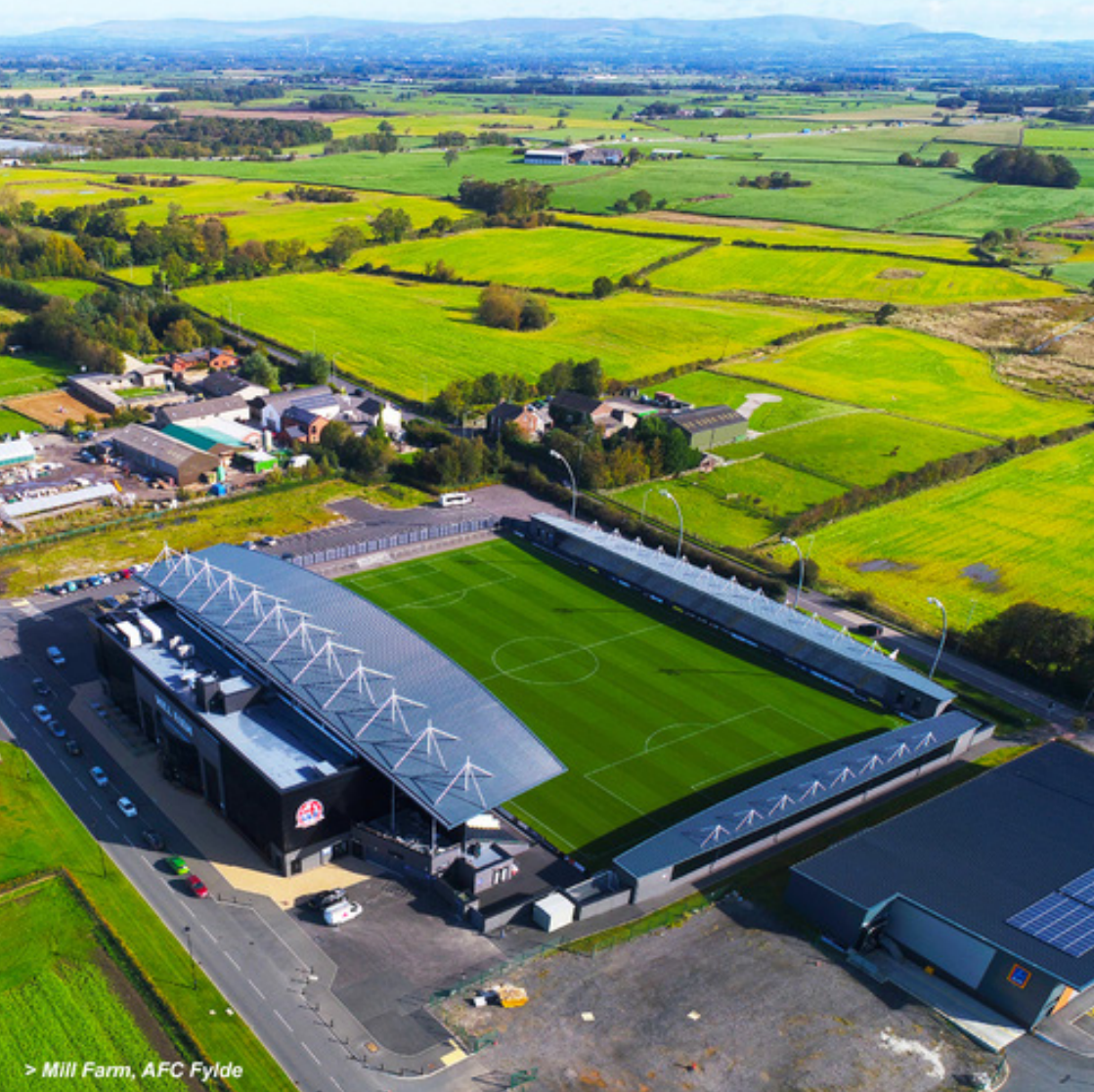
> Mill Farm, AFC Fylde

architecture • project management • structural engineering • interior design building surveying • m&e design • quantity surveying • cdm consultancy