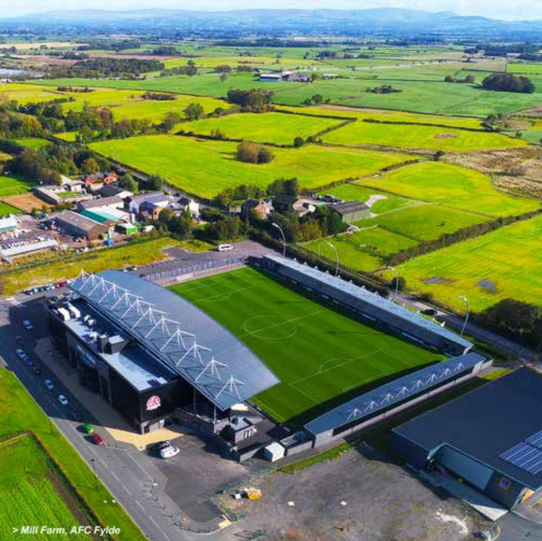
> Mill Farm, AFC Fylde

architecture • project management • structural engineering • interior design building surveying • m&e design • quantity surveying • cdm consultancy